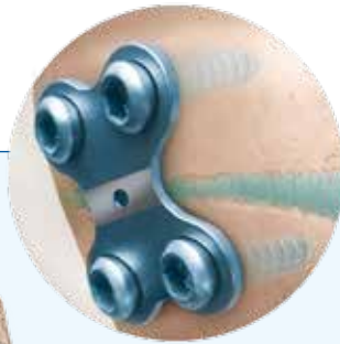
Right Genu Varum