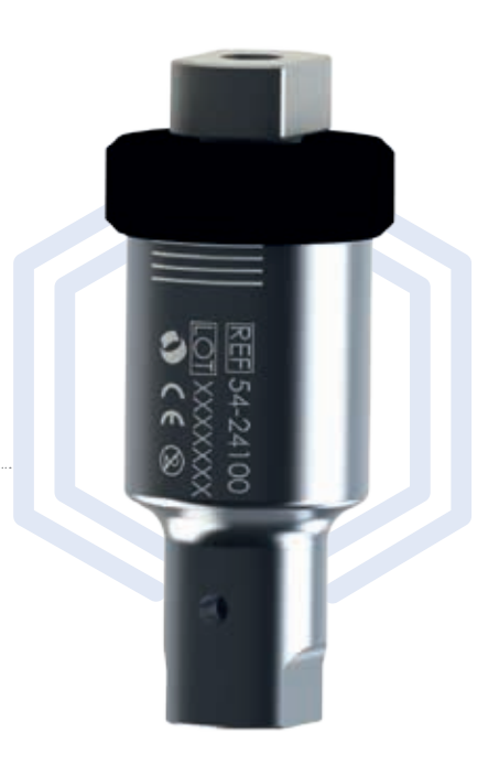
54-24100 TL Dynamization Module

The TrueLok Dynamization Module can be used to dynamize an existing frame towards the end of treatment or at any stage where dynamization of the fracture callus or regenerate is required.