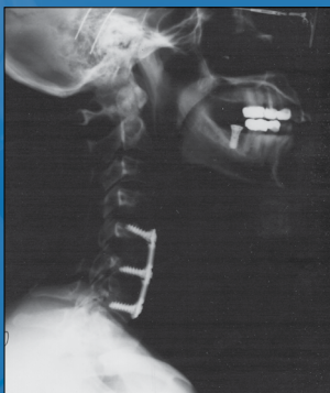
Post-op Lateral X-ray

58 year old right handed woman presented with progressive left neck, shoulder, scapular, and arm pain with tingling into her middle three fingers. MRI showed a large C5-C6 herniated disc and spondylotic complex with cord compression and midcervical straightening